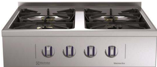
588524 (MBGGBBHOPO) 4-burner gas top, one-side operated with backsplash